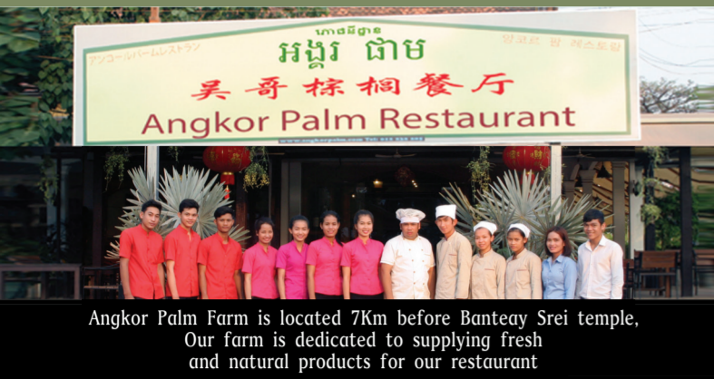
Angkor Palm Farm is located 7km before Banteay Srei temple. Our farm is dedicated to supplying fresh and natural products for our restaurant

Angkor Palm Restaurant No 115 Charles De Gaulle Road and the corner of Rd 60 Tel: 012 23 22 05 - 063 76 14 36 www.angkorpalmpalm.com E-mail: angkorpalmpalm@hotmail.com | Fb: angkorpalmpalmrestaurant